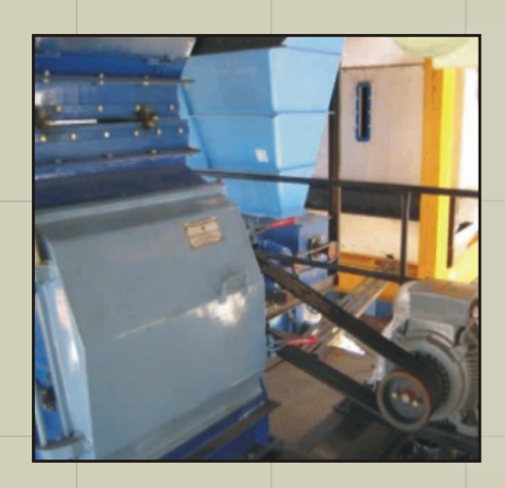
HAMMER MILL (20 TPH)